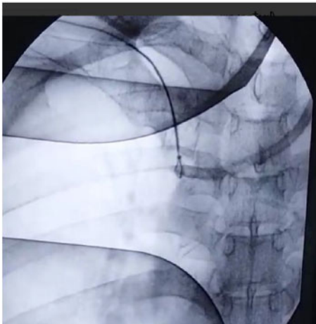
Figure 2. Endovascular technique to remove the stuck catheter using the snaring method.

We found an adhesion between the wall of the left innominate vein and the body of the catheter about 4 cm from the catheter tip (Figure 3), while the catheter tip is placed below the right internal jugular vein. The wall of the left innominate vein was thickening as the catheter went through, and the fibrin sheath was covering the body of the catheter. We decided to incise slowly left the innominate vein longitudinally towards the superior vena cava (SVC) while detaching the catheter against the vein. The catheter was removed; however, neither the left internal jugular nor the left subclavian vein supplied blood to the left innominate vein. We then repair the left innominate vein without using a graft. The patient completely recovered and was discharged home 5 days following surgery.